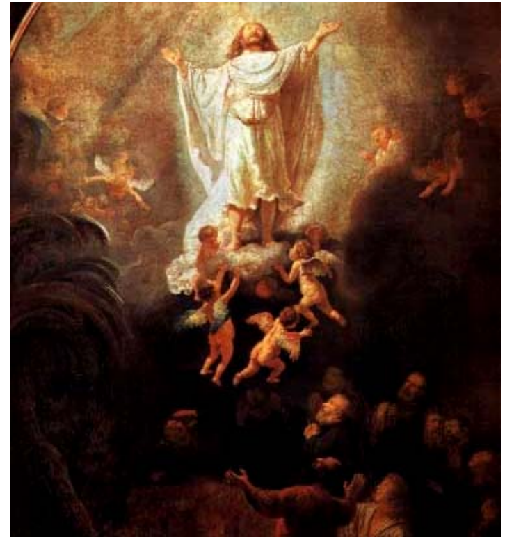
The Ascension by Rembrandt, 1636