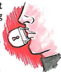
PRIEST'S LIPS LOCKED

A priest must always keep his lips locked about what he hears in confession. One priest even died a martyr's death, because he refused to reveal what he had heard in confession. His name was St. John Nepomucene.