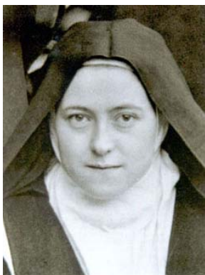
Poetry of St. Therese of Lisieux